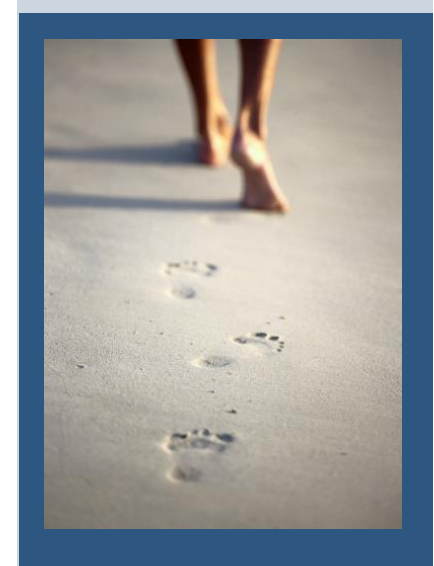
We're with you, at every step of the way.