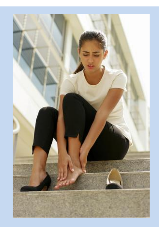
Poorly fitting shoes are a risk factor for diabetic foot ulcers

Peripheral artery disease or narrowing of the peripheral arteries affects the lower extremities. Circulation is drastically decreased, causing pain or cramping in the legs while walking.