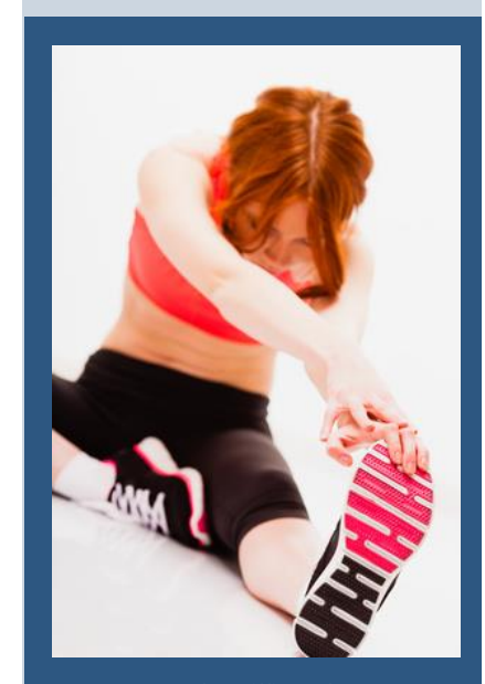
Watch out for difficult foot movements

The Footcare Centre Ltd 8 Monument Green Weybridge Surrey KT13 8QS Tel: 01932 849373