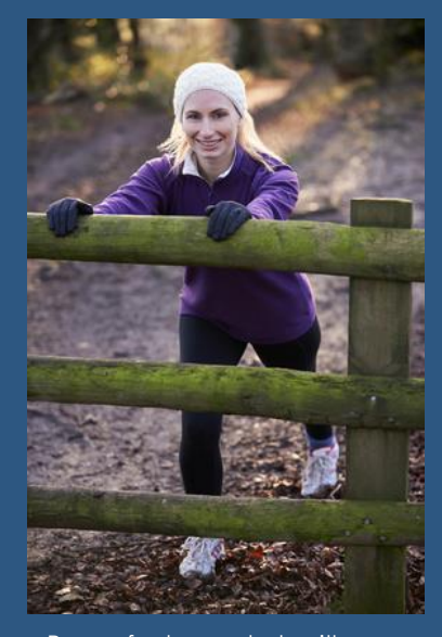
Proper foot care starts with you