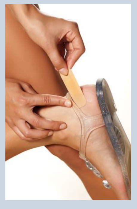
Calluses can cause blisters in the long run