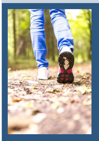
We're with you, at every step of the way.