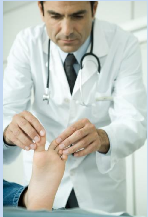
Inspect feet every day to check for signs of irritation

your Doctor or Podiatrist directly as soon as possible.